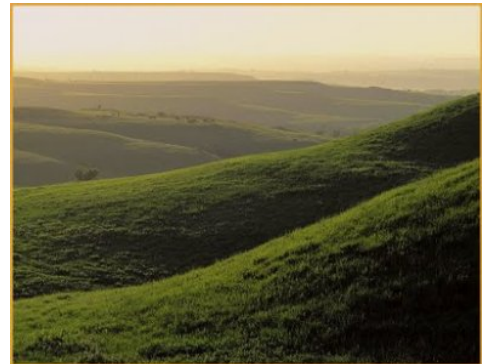
large hill, foot hills